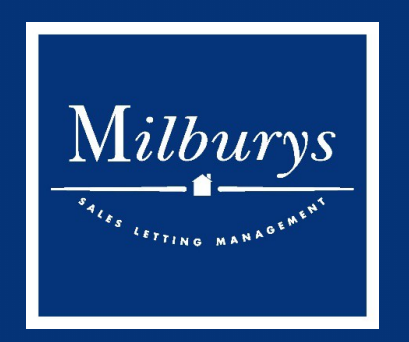
Cottage 'To Let' £1,200 PCM The Annexe, Vine Farm, Oldbury Naite