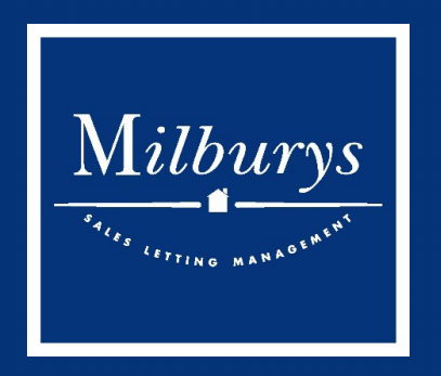
House 'To Let' £1,550 PCM Wotton Road, Charfield