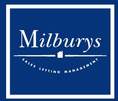
House 'To Let' £1,395 PCM Gillingstool, Thornbury